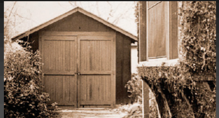
The HP Garage - 1939

We have supported education projects for more than 65 years and has invested more than $250 million in education since 2000.