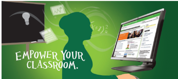
HP Teacher Experience Exchange